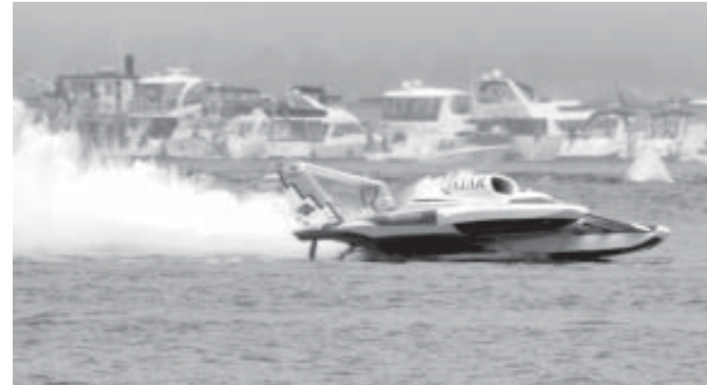
Spirit of Qatar get very loose on the front stretch in 3B, but goes on to win the heat by a good margin.